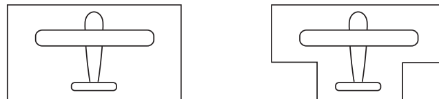
Figure A-1-3(a) Freestanding unit for single aircraft.