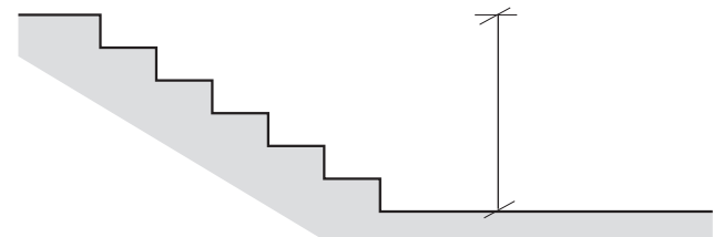
FIGURE A.5.5.6.3.2.3(2) Distance Measure for Walk Time Computation.

A.5.5.6.3.2.3(2) The vertical component of travel speed is calculated based on the vertical change in elevation between each station level. See Figure A.5.5.6.3.2.3(2). See also Application Guidelines for the Egress Element of the Fire Protection Standard for Fixed Guideway Transit Systems , and the example calculations in Annex C.