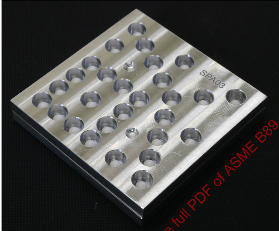
Figure A-1-1 A Square Two-Piece Sphere-Hole Plate With Covering Hole Plate